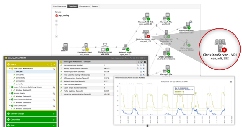
eG Enterprise provides actionable performance insights, automated root cause diagnosis and analytics